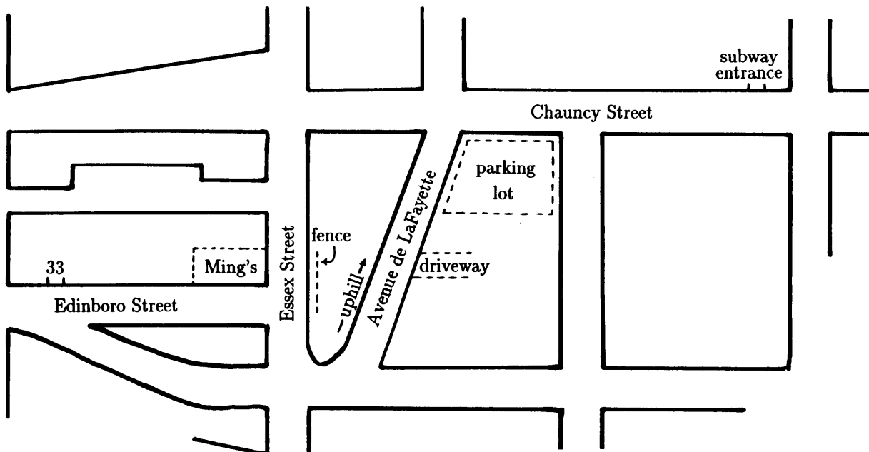
Figure 2. The route from 33 Edinboro Street to the Washington Street subway station, early 1986. (Not to scale.)

When I walk this route myself I typically cut through a parking lot that precedes the “first right.” The directions leave out the parking lot altogether; presumably you will have the sense to see the first right coming and cut the corner; and it doesn’t matter if you don’t. You’ll also need the sense not to interpret a driveway or the parking lot itself as that first right. Everyone relies heavily on these sorts of things, usually without specifically knowing it, when giving directions. Some people are better at it than others. For example, experienced urban direction-givers know that alleys can confuse people who’ve been directed to count lefts or rights.